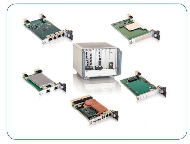
Image 1: Flexible hardware: Whether processor boards, network controllers, XMC or HDD / SSD carriers, all CompactPCI ® Serial components are modular and also available as complete pre-integrated system configurations.

Owing to the modular system structure, components can be assembled according to specific requirements. They can easily be adapted to fit the required performance level and also be extended at any given time. The system configuration can be carried out very flexibly based on the standard components, which can be assembled building block-style. The system concept is so plausible, easy and precisely specified that realizing a system configuration is a fast and easy process.